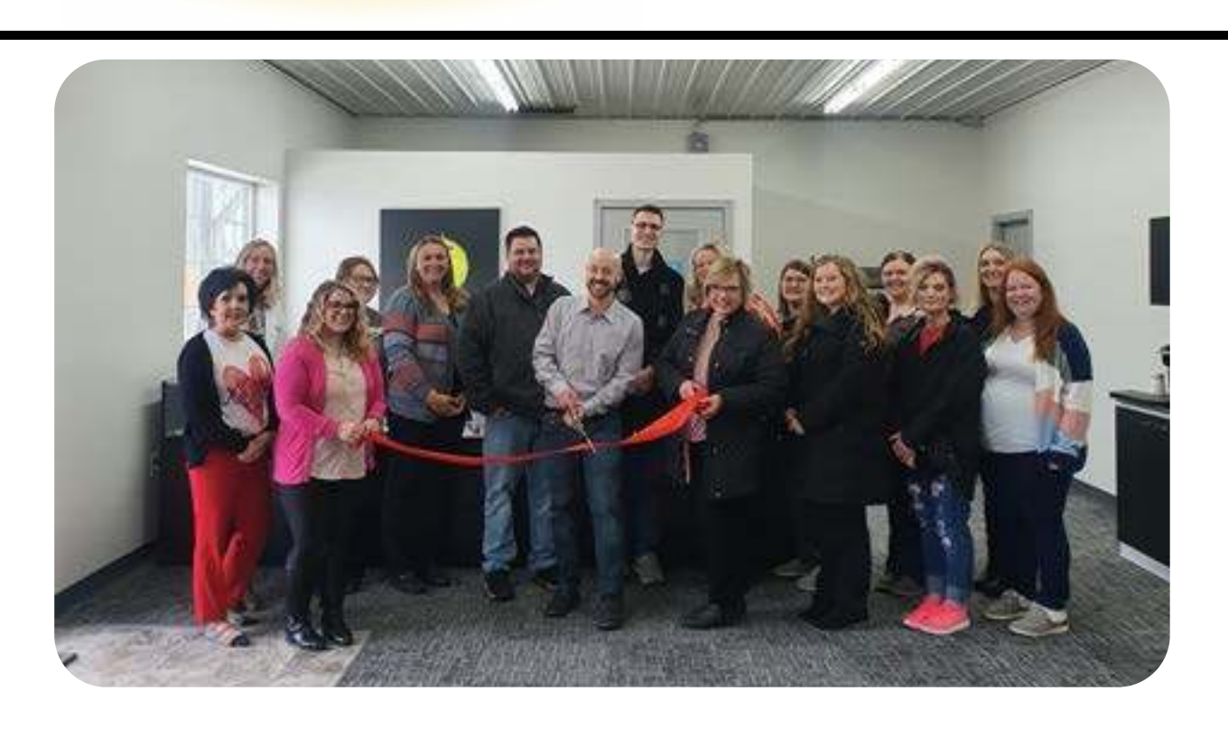
Green Apple 73 Minnesota Ave. Breckenridge, MN www.facebook.com/greenappleminnesota